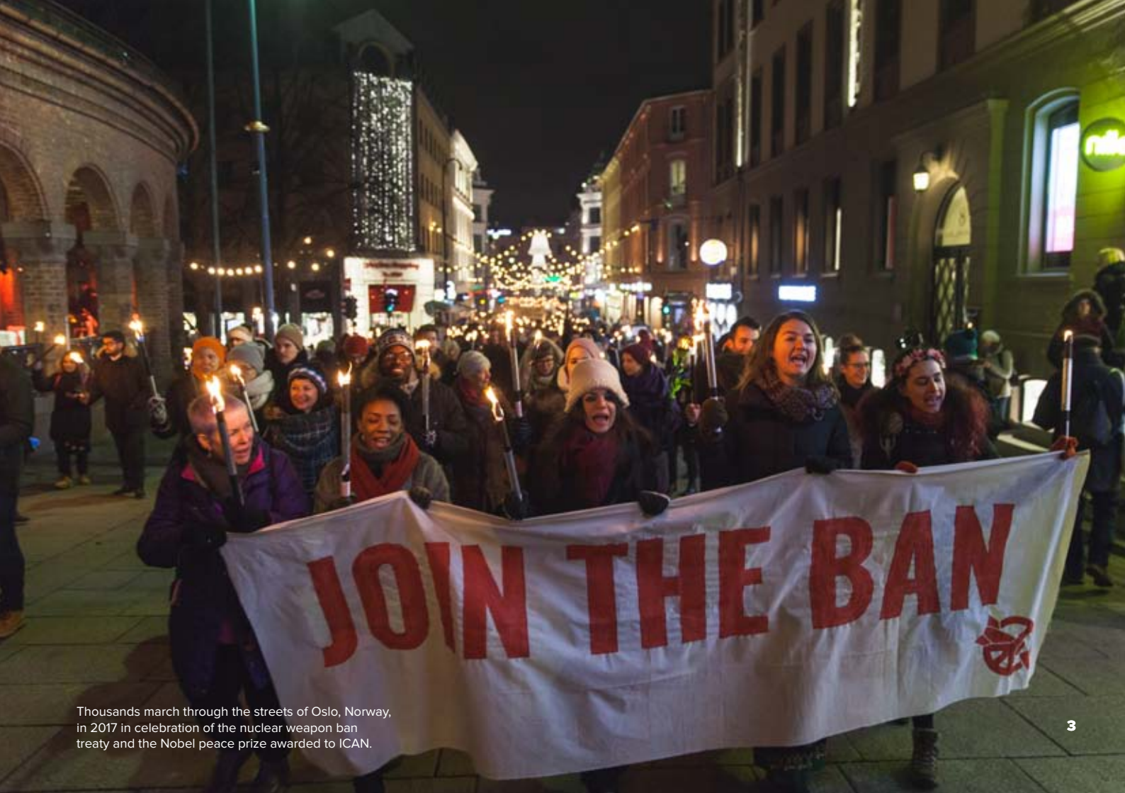
Thousands march through the streets of Oslo, Norway, in 2017 in celebration of the nuclear weapon ban treaty and the Nobel peace prize awarded to ICAN.